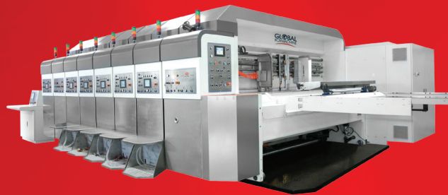
K7 io Capable Flexo Rotary Die-Cutter