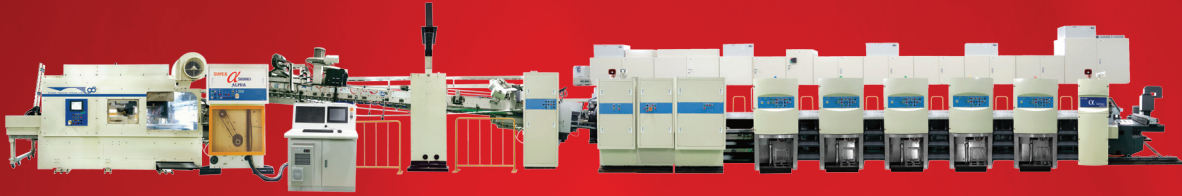
SHINKO Super \alpha Flexo Folder Gluer