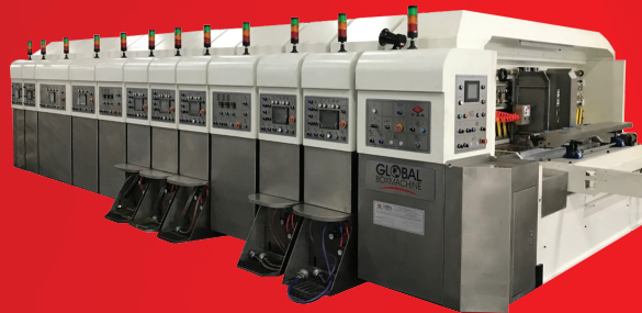
KLS io Capable Flexo Folder Gluer