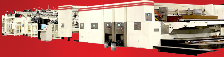
K1-X Jumbo Flexo