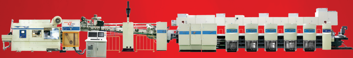
SHINKO Super \alpha Flexo Folder Gluer